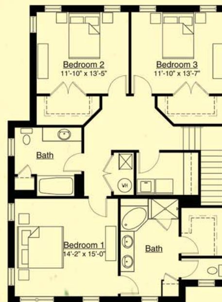
Unit A1 Third Floor Plan