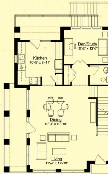
Unit A1 Second Floor Plan