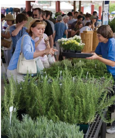
Carrboro Farmer's Market

As Carrboro's first village mixed-use neighborhood of single family homes, townhomes, and unique live/work environments, the dynamic Winmore community includes the following distinctive features: